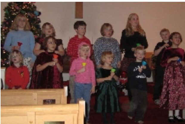
Ringing the Bells