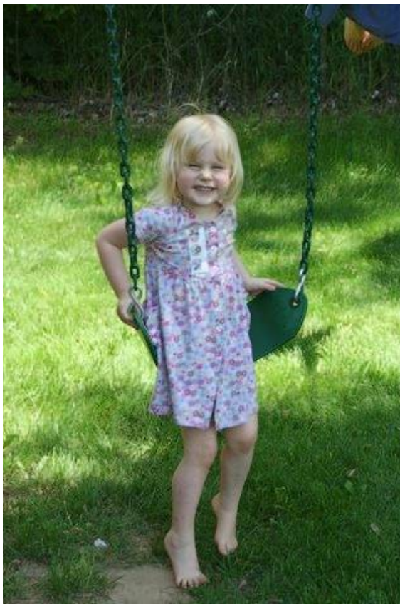
Fun on the swings